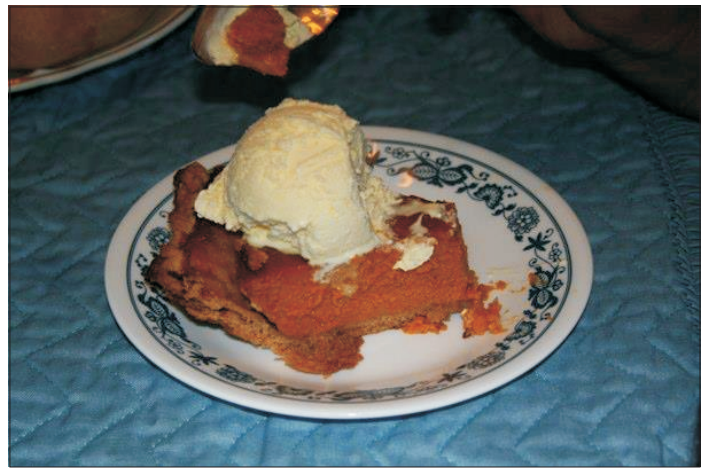
My homemade pumpkin pie

They have turkeys here, but no stuffing or pumpkin to make pies, so I usually bring them back with me