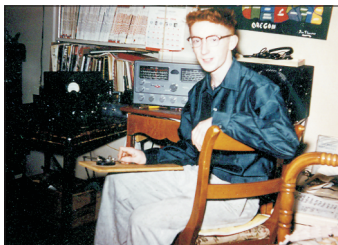
My radio station in 1956

I try to relax every now and then and on some evenings when there isn't a home Bible study or a meeting, I sit down and talk on my ham radio. Since 1956, and a sophomore in high school, I have been licensed. I hold a license in the U.S. (WB7VRO) and also in Chile (CE3BPC). Through the