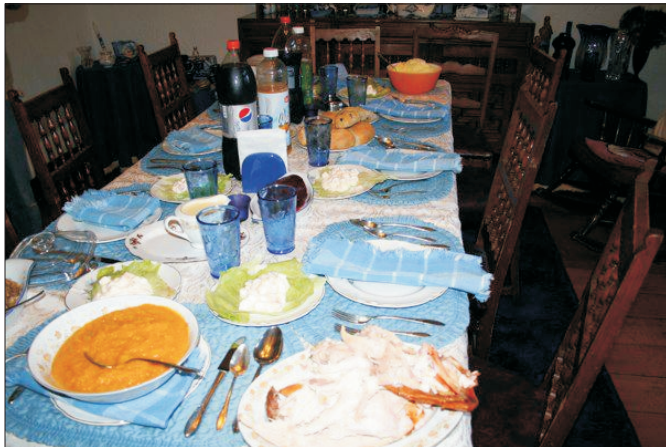
Our table setting